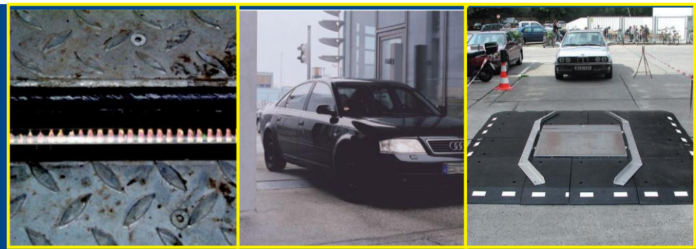
System is available as a fix or a mobile one.

The system consists of a control pc and a scanner unit, which contains one or more cameras. These have a free sight to the under body of the vehicle via a special mirror, positioned in angle in an aim to save installation height.